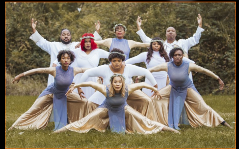
POS Dance Company