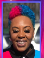
Minister Georgia "Mime" Haynes