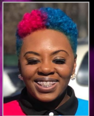
Minister Georgia "Mime" Haynes