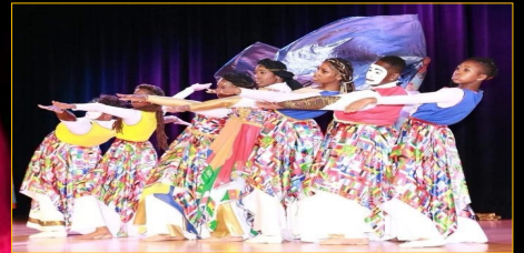
Heavenly Touch Dance Ministry