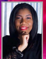
Minister Chantaya King